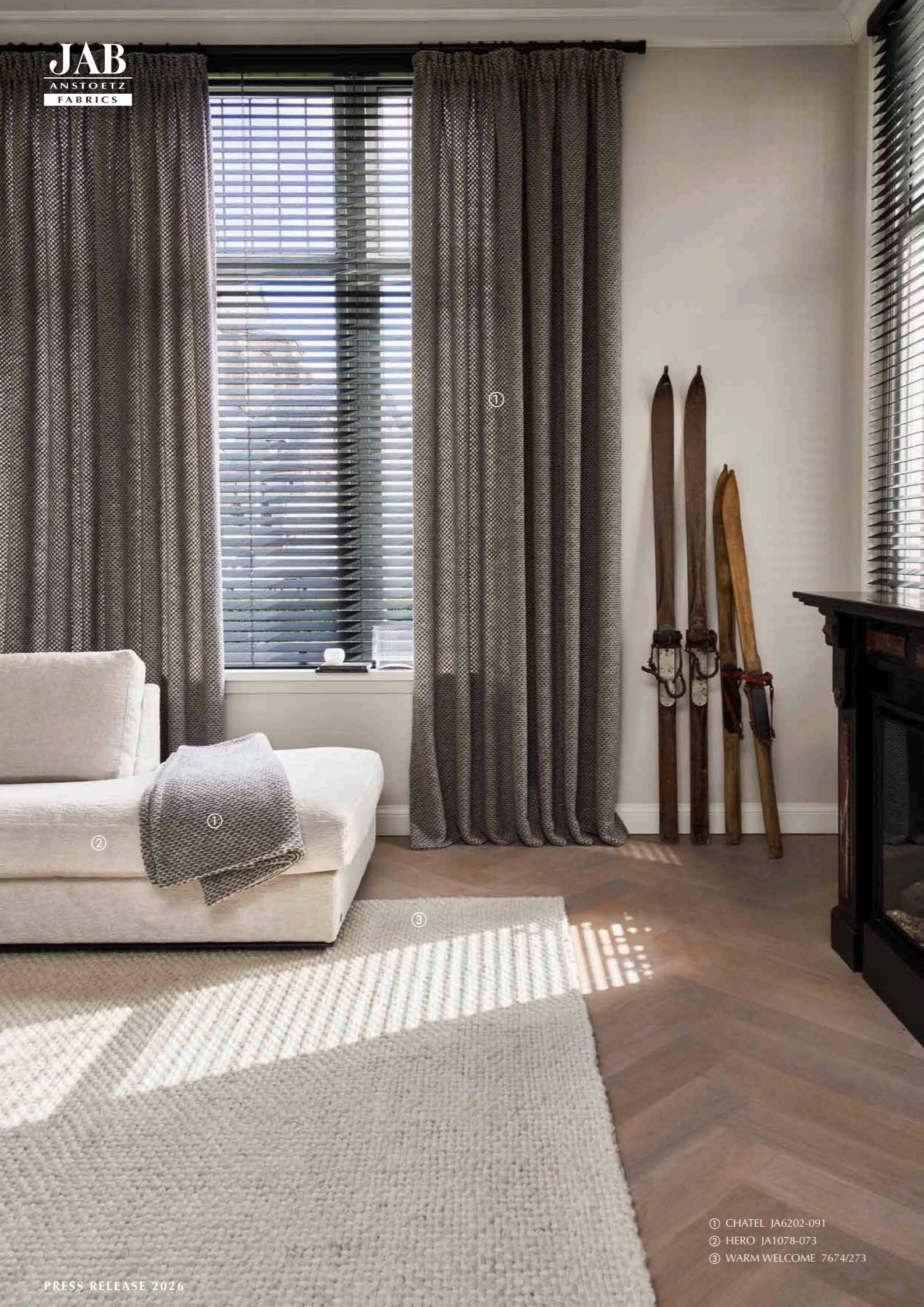
① CHATEL JA6202-091 ② HERO JA1078-073 ③ WARM WELCOME 7674/273