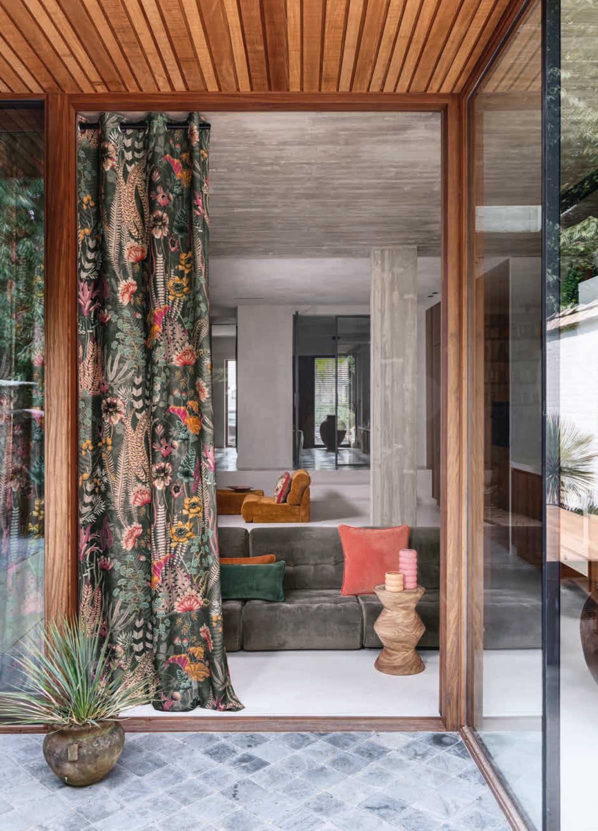
RITUAL SPIRIT CH3247 · BIG PUNCH CH3125