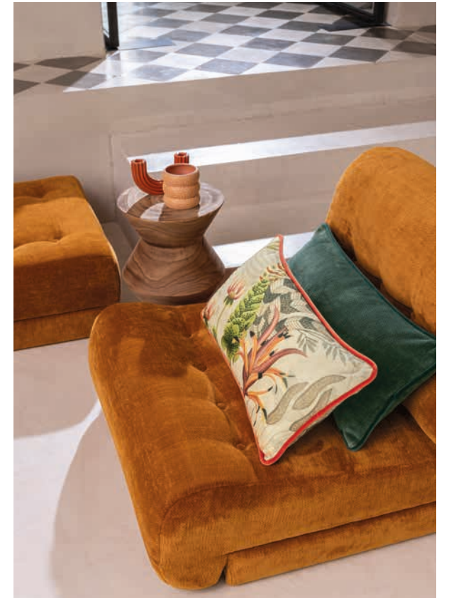
BIG PUNCH CH3125 · RITUAL SPIRIT CH3247