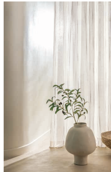
LOVE AFFAIR CH3227 · PARADISE KISS CH9130 · WILD HEART CH3228