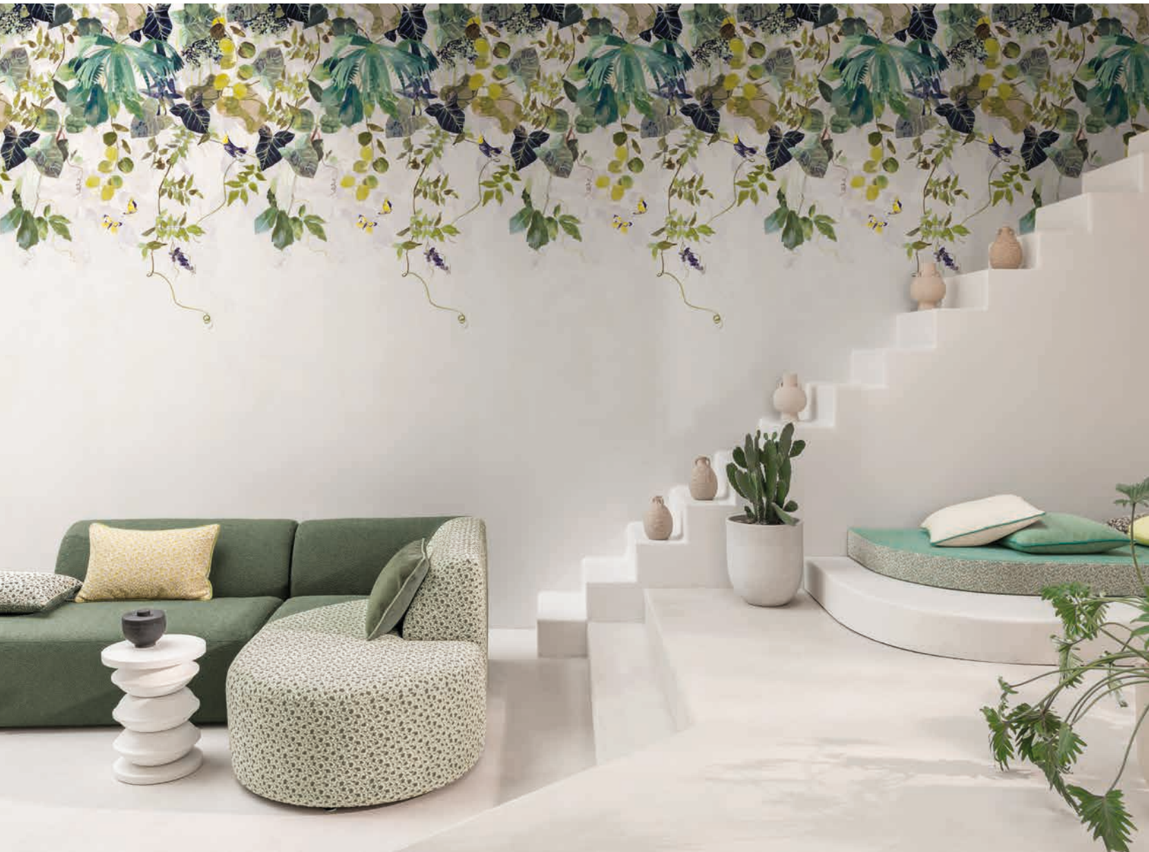
PARADISE KISS CH9130 · WILD HEART CH3228 · FREE SOUL CH3205 · SWEETEST TABOO CH3230