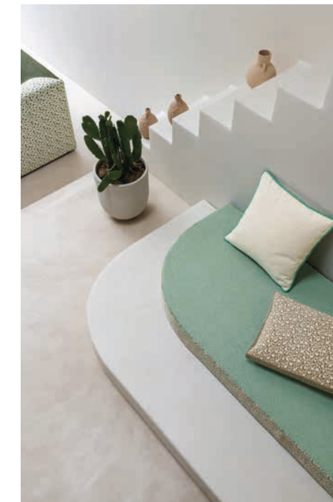
WILD HEART CH3228 · FREE SOUL CH3205

LARGE SIZE MURALS WITH A FLATTERING CHARM