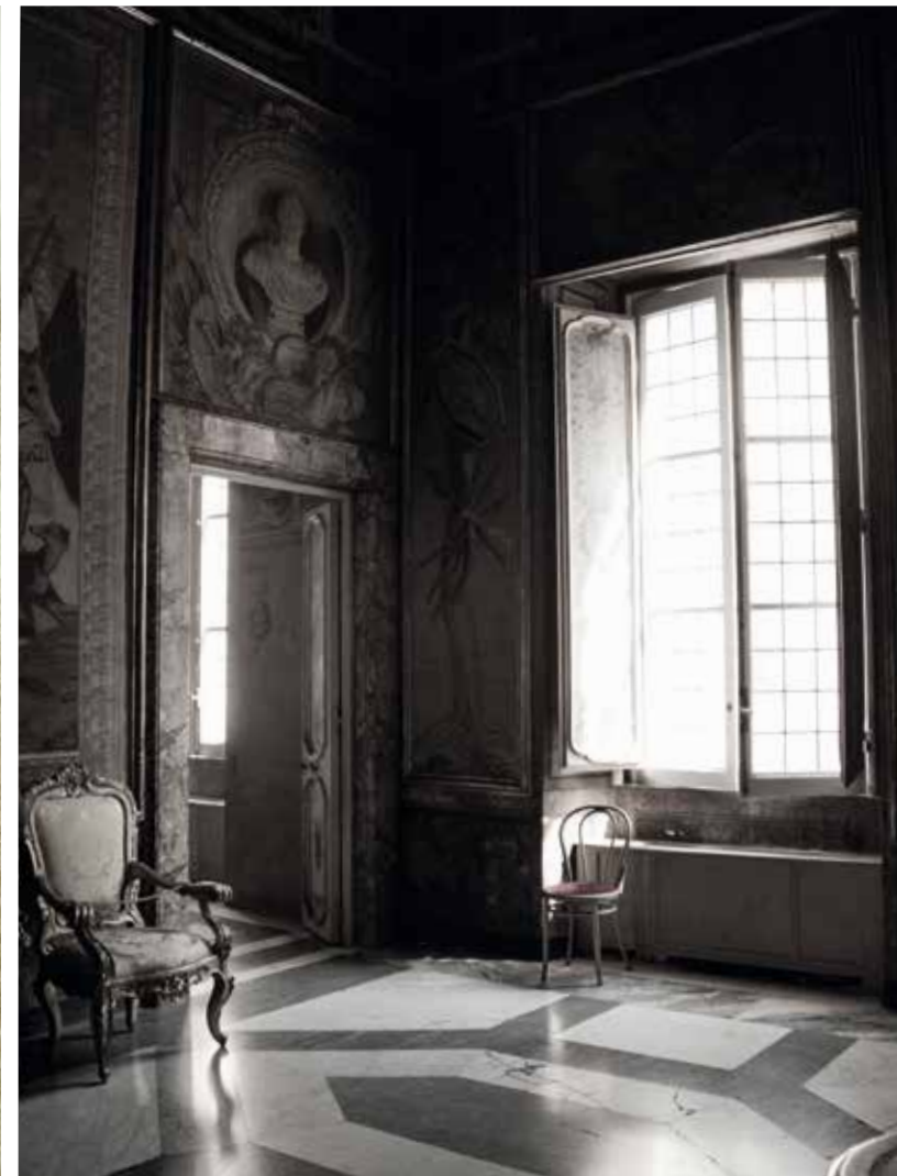
VIVARO CA1415, VIVEZZA CA1413