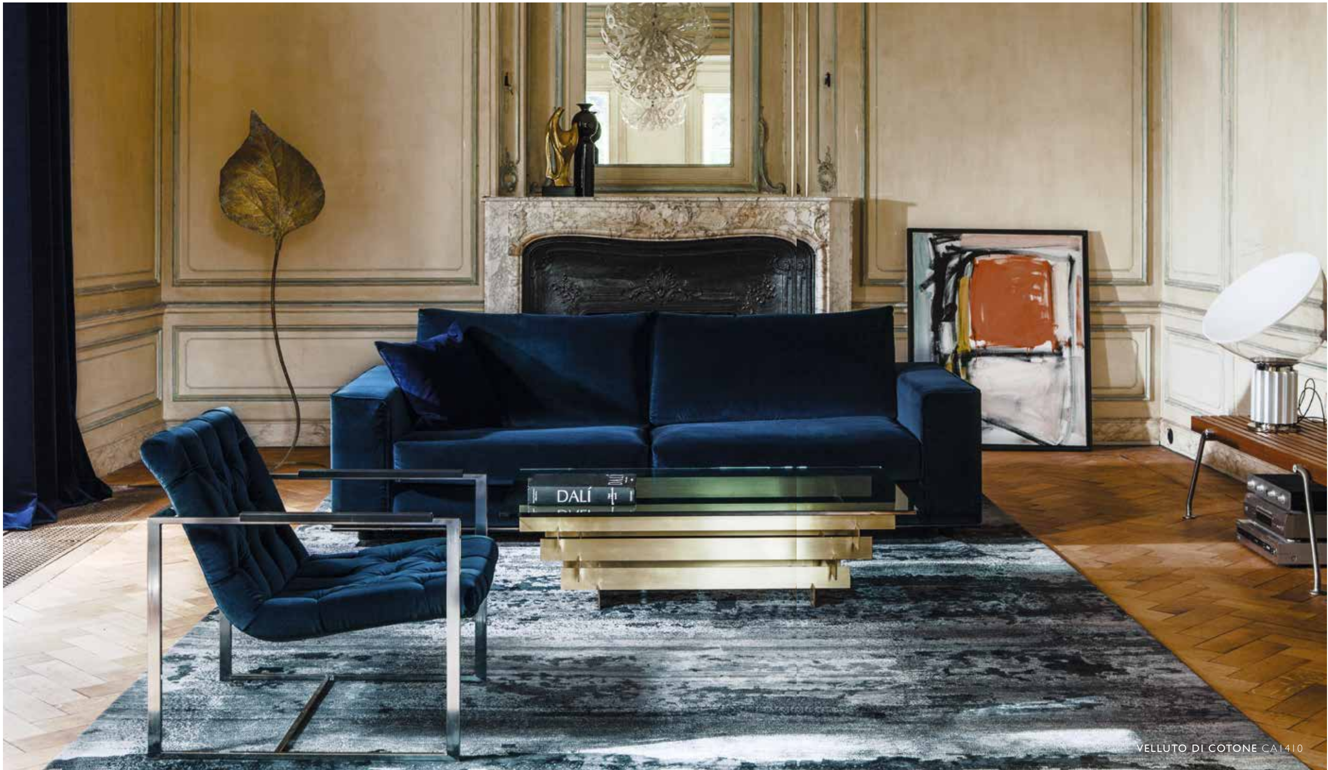
VELLUTO DI COTONE CA1410