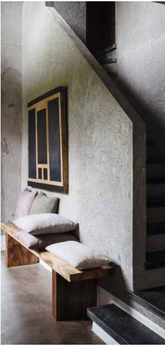
CARDELLINO CA8254, LINO LAVATO CA1403