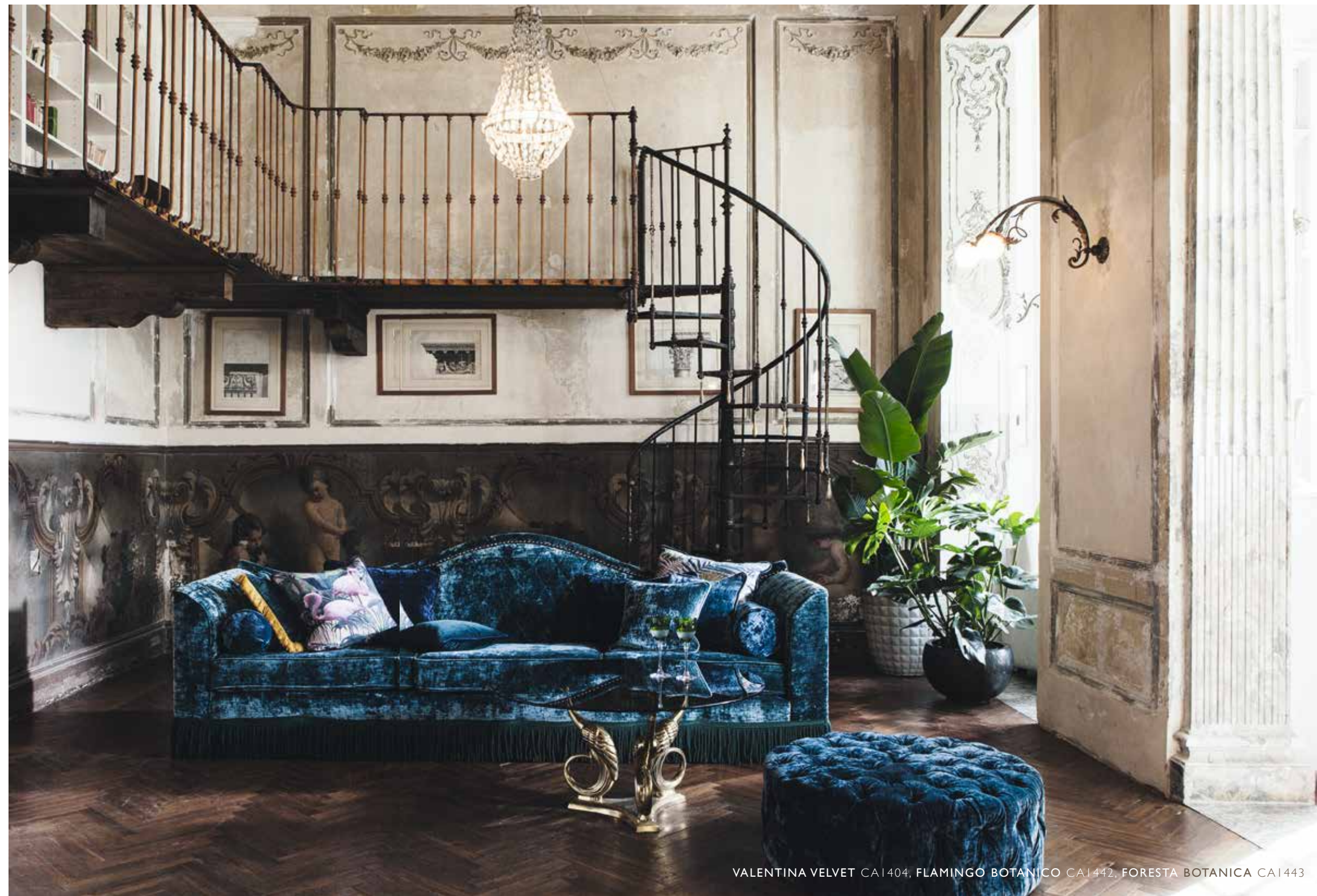
VALENTINA VELVET CA1404, FLAMINGO BOTANICO CA1442, FORESTA BOTANICA CA1443