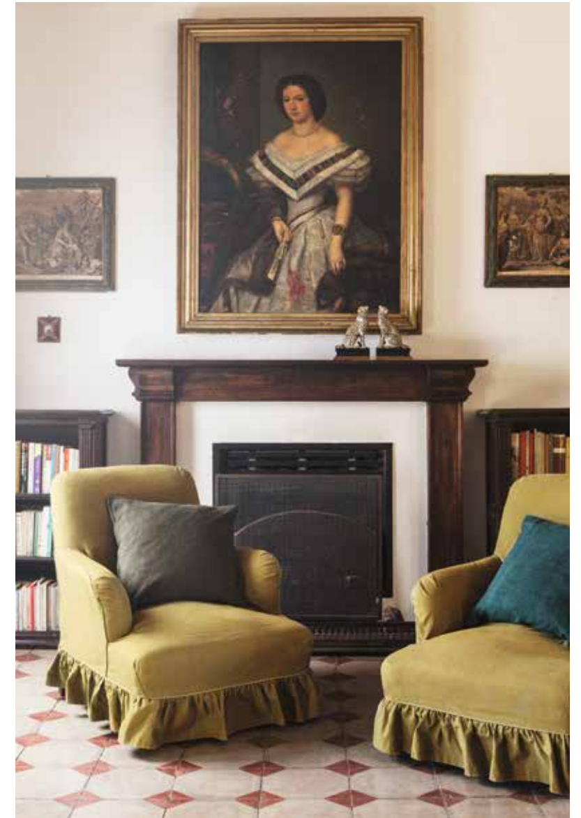
DOLCE LINO CA1402