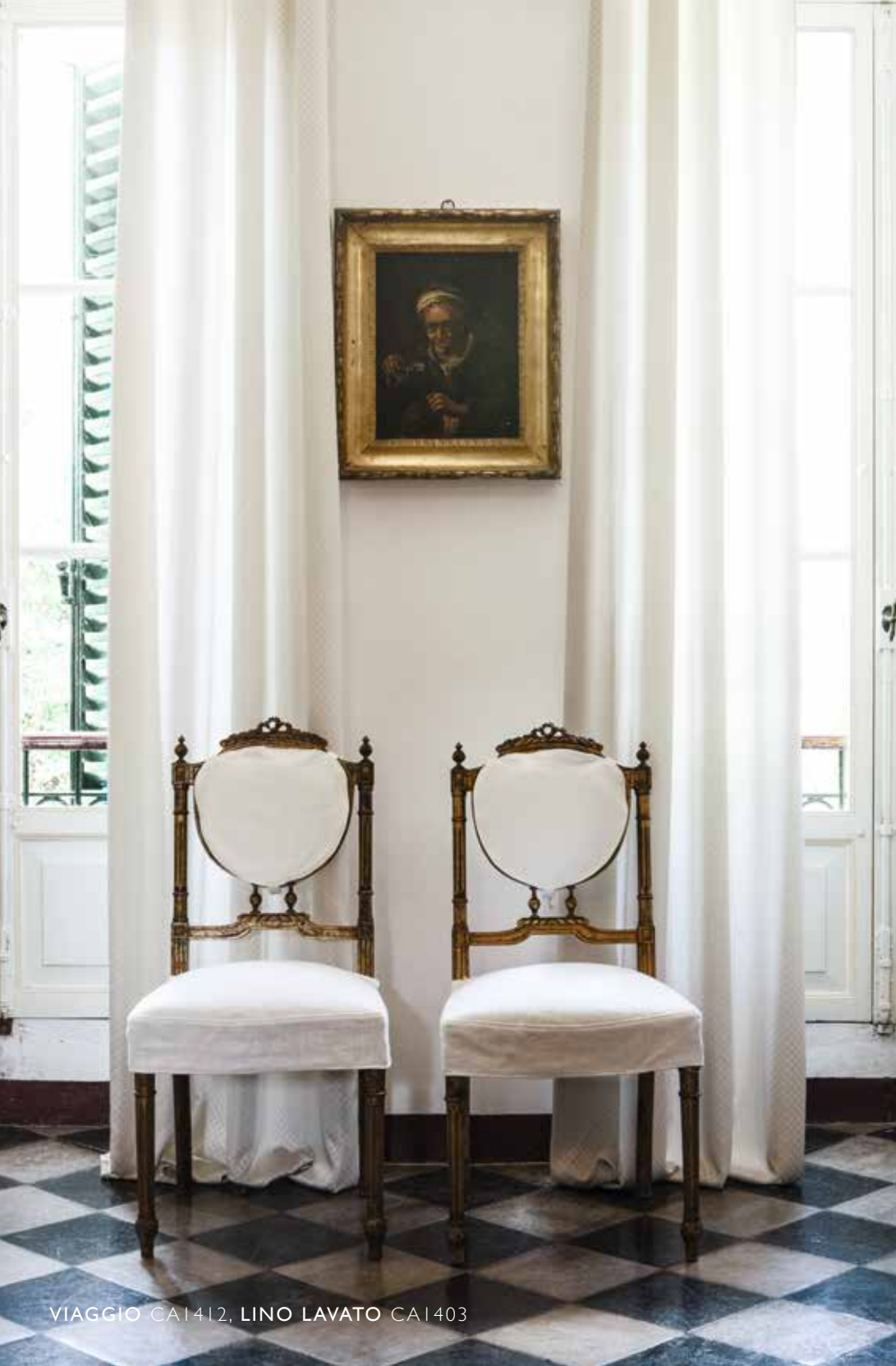
VIAGGIO CA1412, LINO LAVATO CA1403