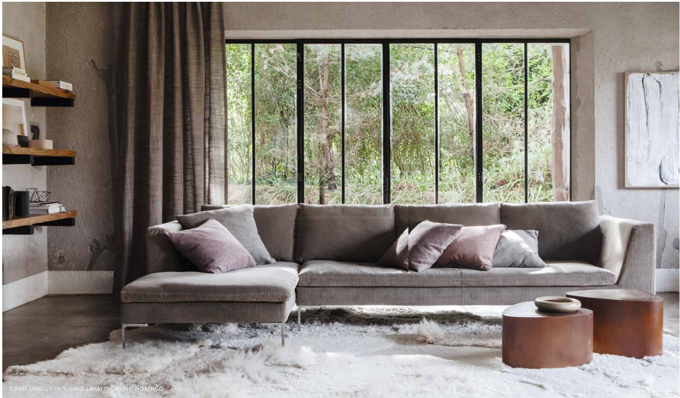
CORD UNO CA1419, LINO LAVATO CA1403, NORDICO CA1411