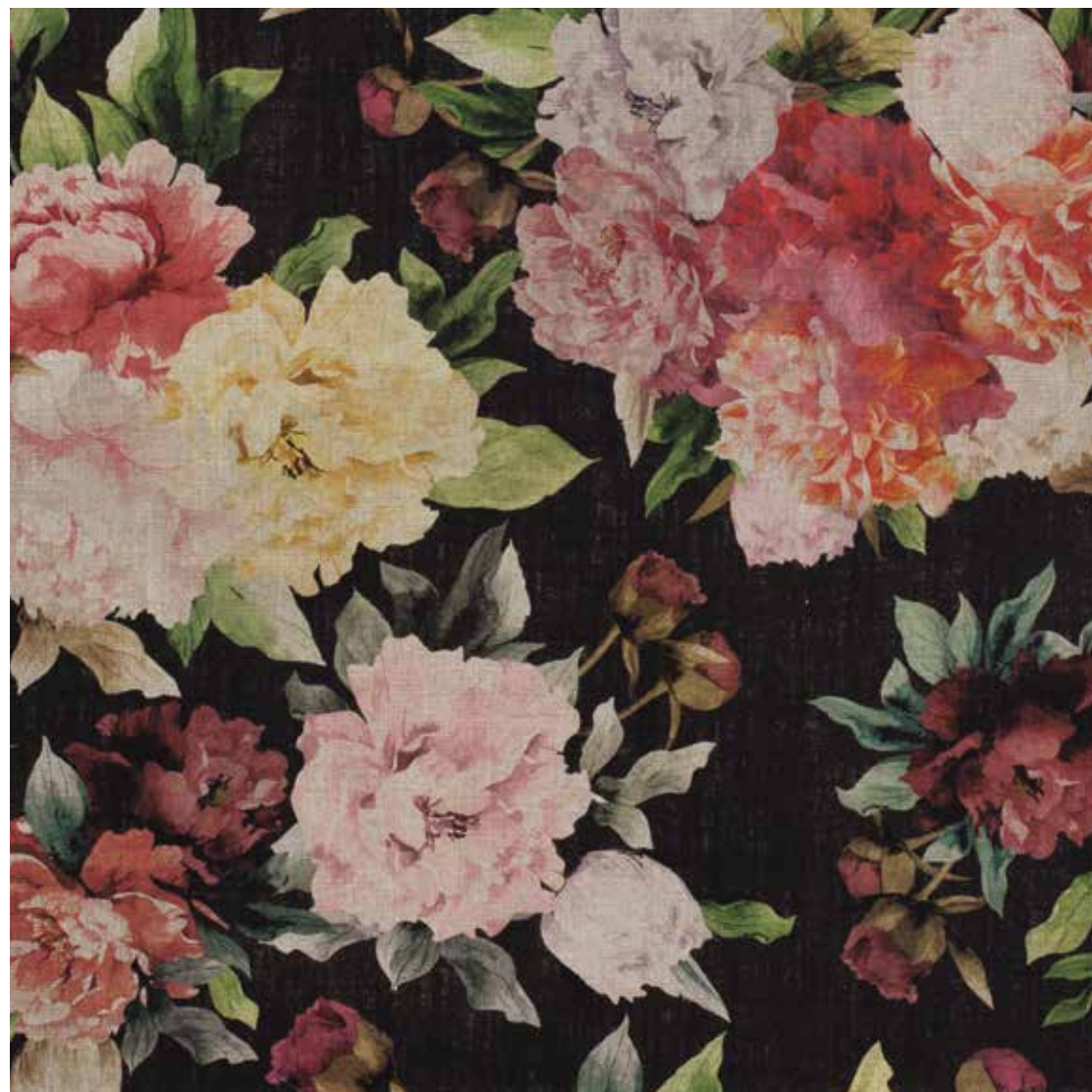
FIORE BOTANICO CA1444