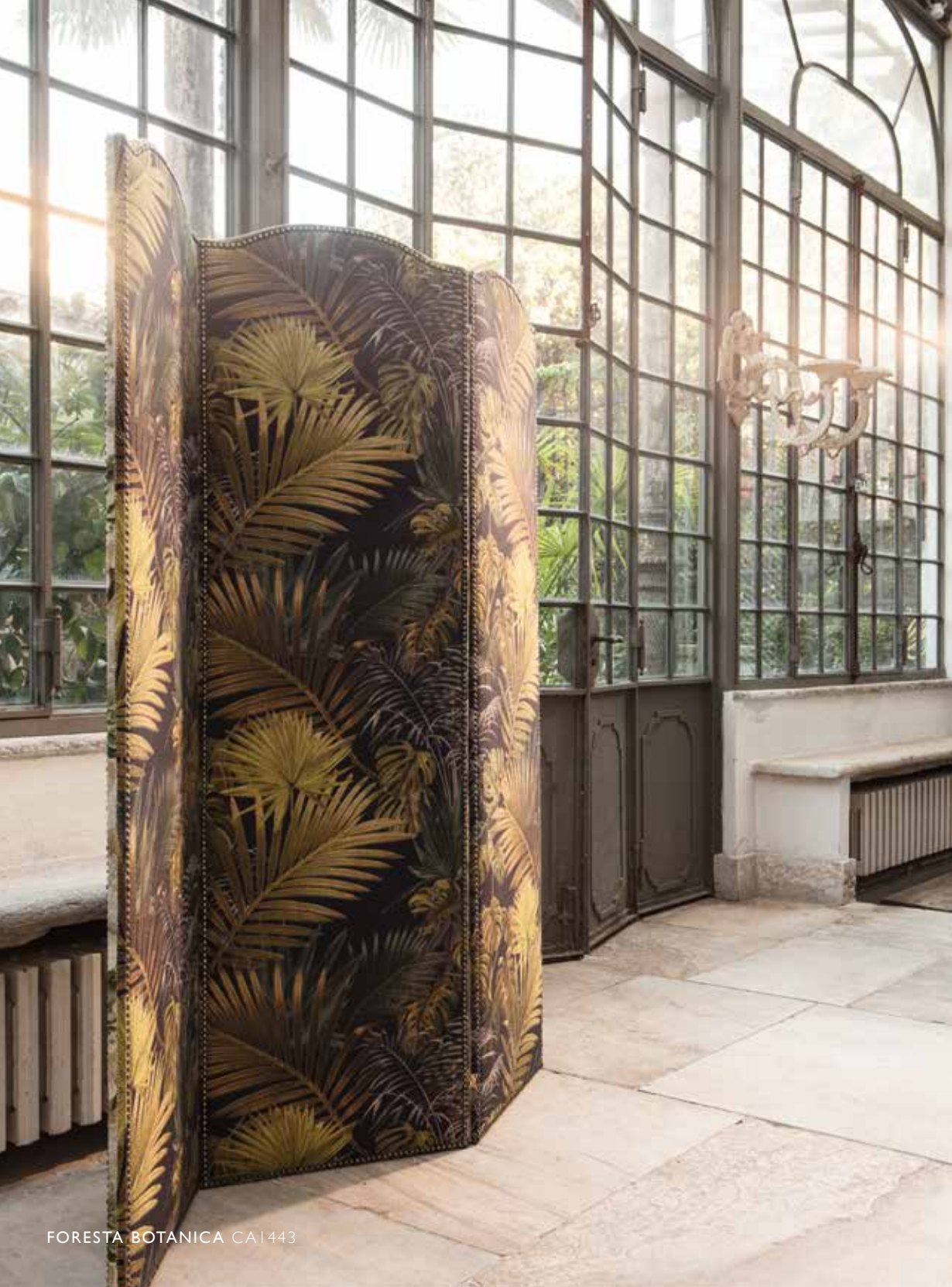
FORESTA BOTANICA CA1443