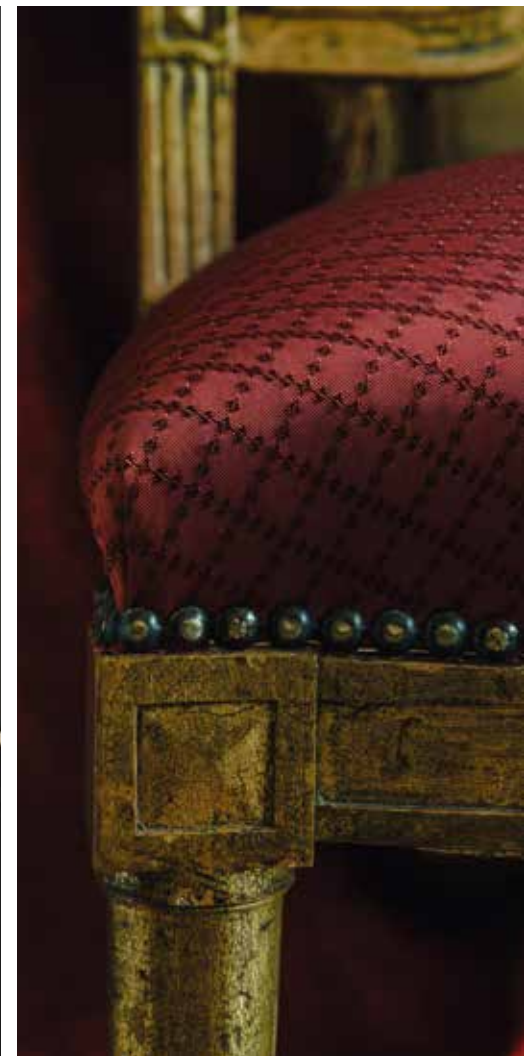
FAVILLA BOTANICA CAI441, VALENTINA VELVET CAI404, VIAGGIO CAI412