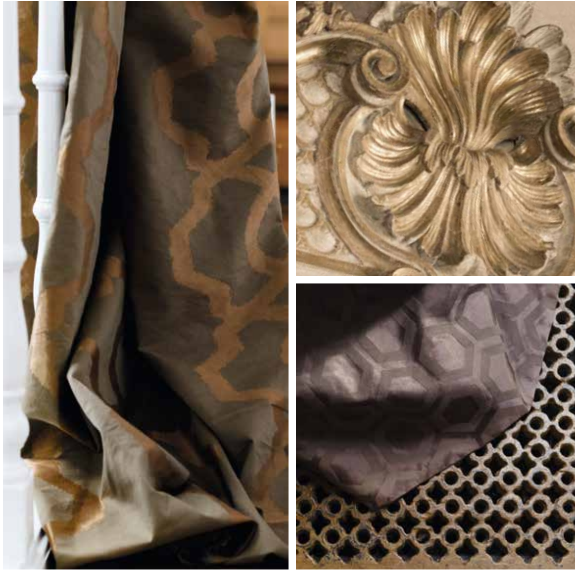
MOVIMENTO CA1440, METROPOLITANA CA1429