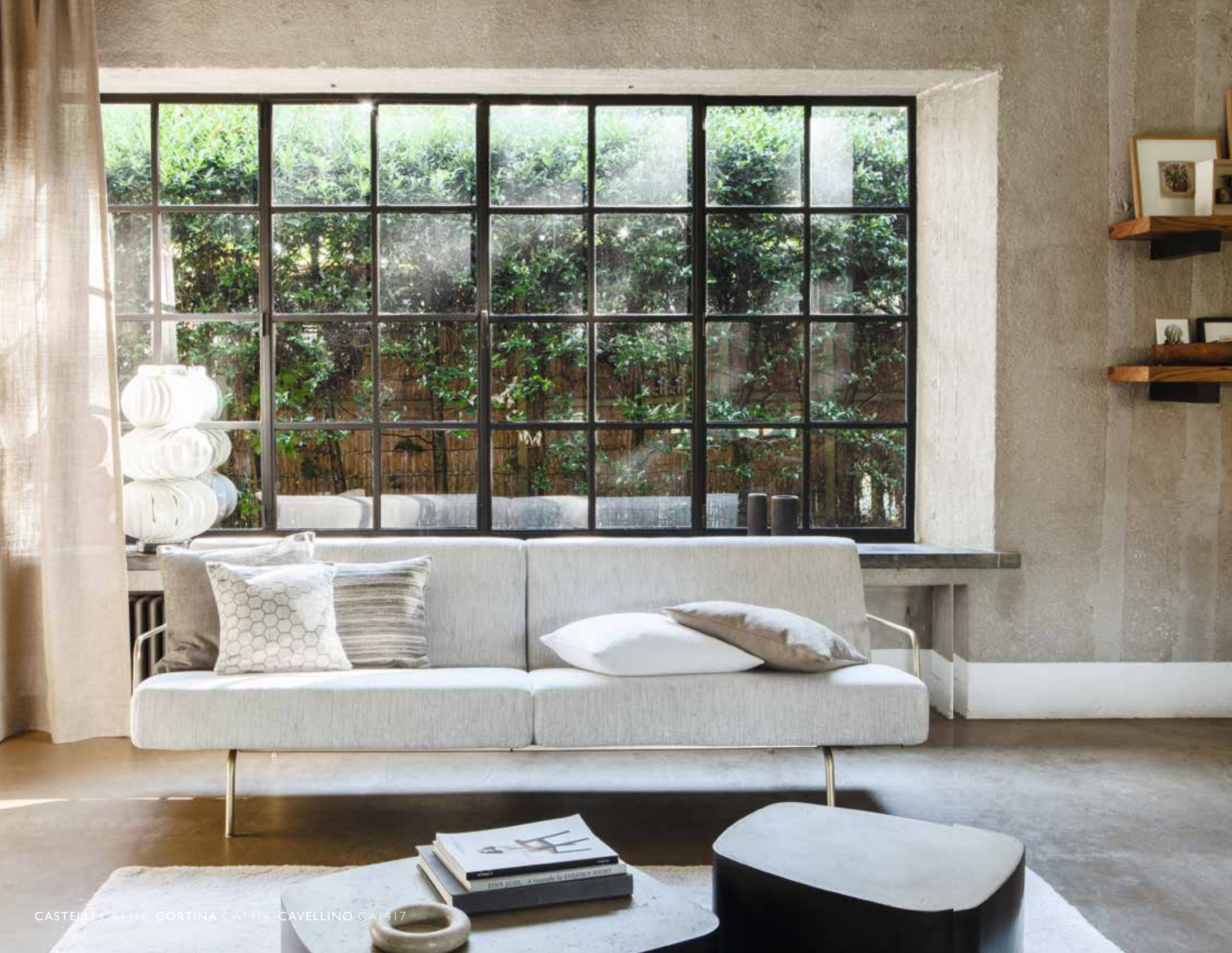
CASTELLI CA1418, CORTINA CA1416, CAVELLINO CA1417